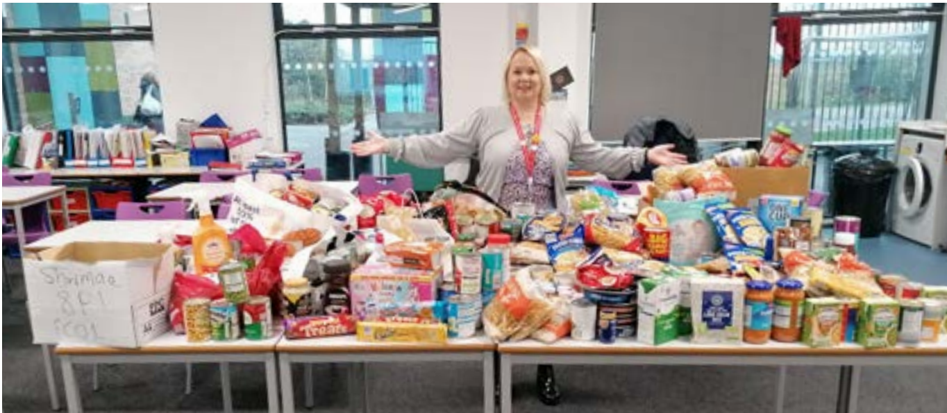
Staff and pupils have recently collected food items for the PATCH food bank